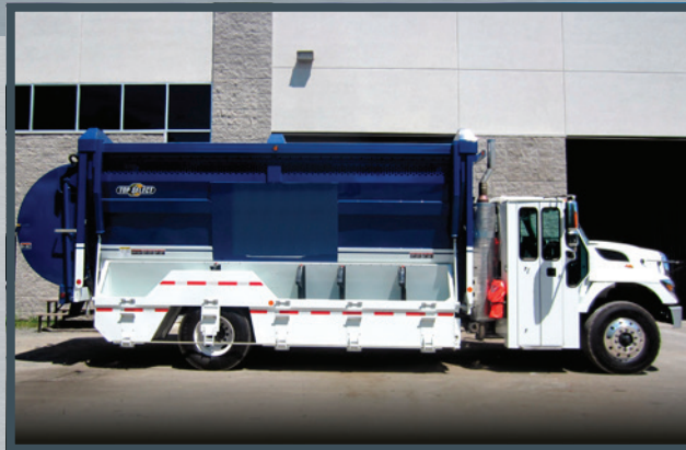
Top Select™ 1000