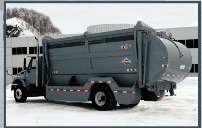
Top Select™ 2000 Maximizer