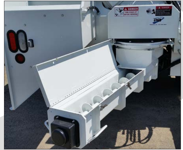
Optional Side Discharge Auger