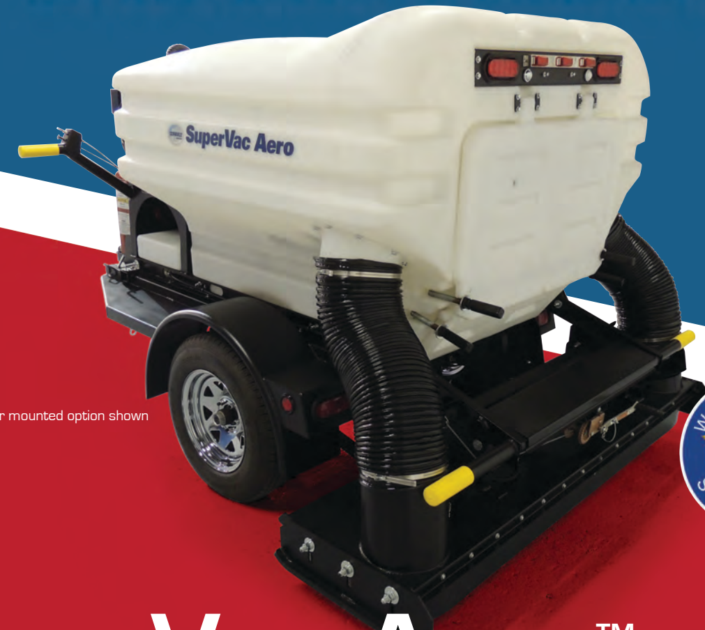
*Trailer mounted option shown

The People You Know. The Products You Trust.