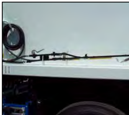
Emulsion wand stores securely in combination with waste tank to separate waste from usable material.