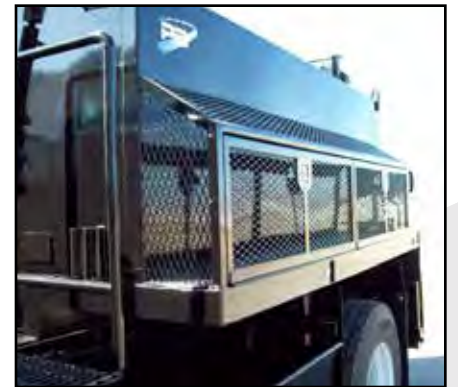
Secured storage in any size and shape for tools of any kind.