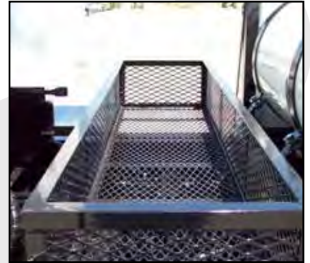
Easily accessible tool baskets for large or bulky items.