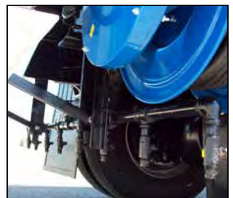
Spray bars allow your pothole patcher to double as a liquid asphalt distributor when necessary.