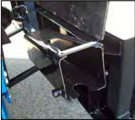
Pneumatic breakers and custom lockable holders built to fit your hammer.