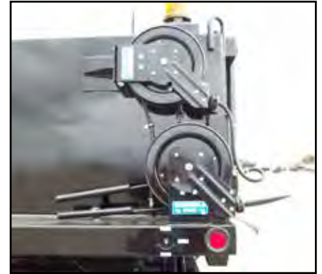
Hose reels of all sizes with the ability to mount in any location.