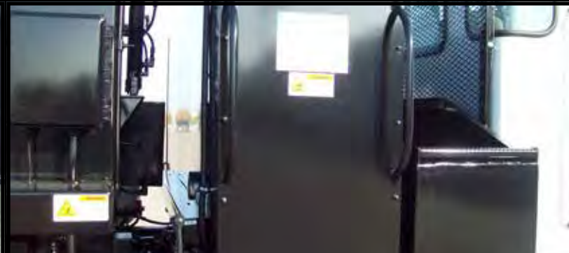
Heated, pressurized and pump-style emulsion systems make your patching program effective year-round.