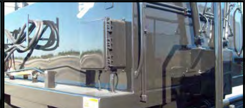
Integrated asphalt heating and emulsion systems to ensure waterproof pothole patching.