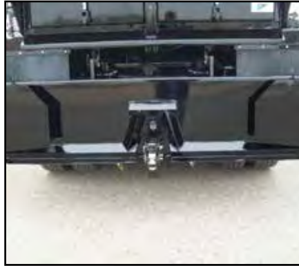
Options available for all hitch types and heights.