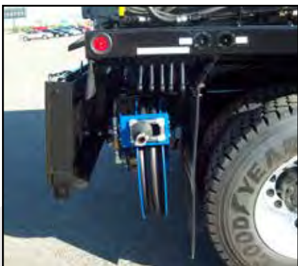
Rear ergonomic controls and pneumatic lines located curb side to keep workers away from traffic hazards.