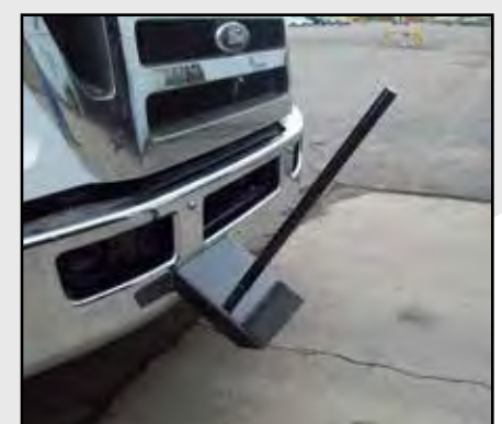
Bumper mounted Cone Holders save space and increase visibility.