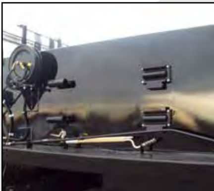
200,000 BTU hand torch eliminates moisture from potholes prior to sealing and patching.