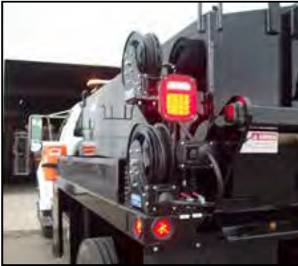
Air and solvent wands aid in clearing debris from potholes prior to sealing and patching.