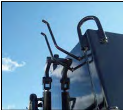
Rake, shovel and broom holders in several styles for convenient use and storage.