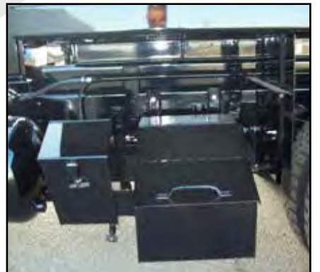
Sand box carries base material for deeper potholes and a solvent dip tank to clean tools before and after patching.