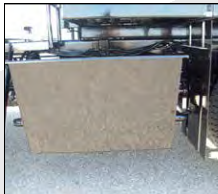
Hydraulic Dumping Spoils Bin