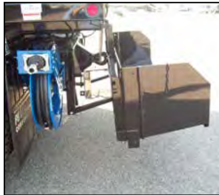
Folding Asphalt Patch Apron is removable for your convenience.