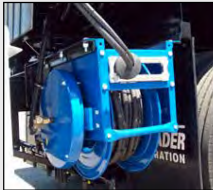
Dual hose reels optional for convenient air and emulsion spraying from the same wand.