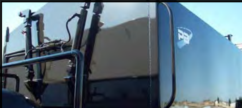
Heavy duty insulated asphalt boxes for durability and heat retention.