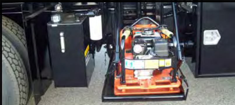
Several compaction options for pothole longevity.