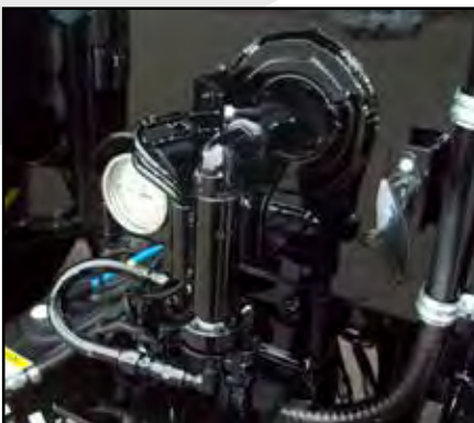
Electric and propane heater systems are available to keep emulsion systems hot around the clock.