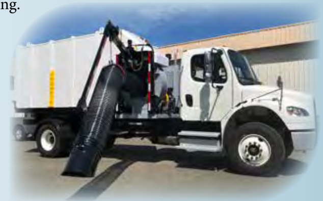
*Units may be shown with options.