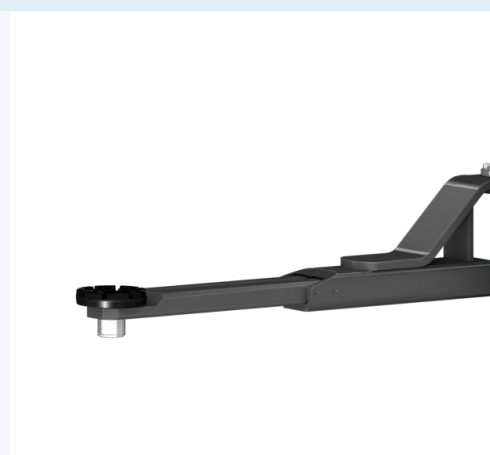
LoPro arms : extremely flat construction. Very sturdy, made of solid material. Especially suitable for very low and wide sports cars.