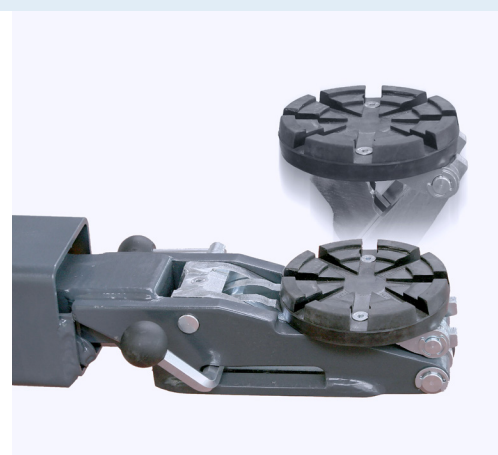
Mini-Max lifting arms : easy and convenient to lift off-road vehicles as well as low clearance vehicles