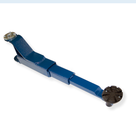
3 stage lifting arm